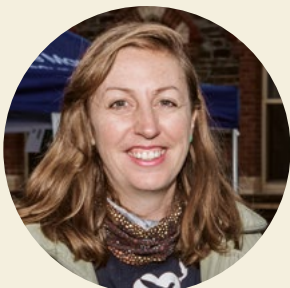
Lauren Foundation Volunteer

The time and effort that they put into every quilt is exemplary. For me to be able to prepare the quilts ready for distribution, is truly a privilege. I’m sure these quilts brighten up patient’s days and is one way of showing them, that they are lovingly cared for. Thank you.”