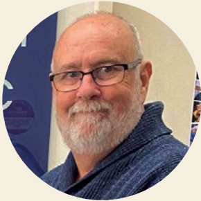
Russell Foundation Volunteer

Written in their own words, these heart-warming reflections shine a light on the care you bring to patients and their families when it matters most, through the eyes of our dedicated Foundation volunteers.